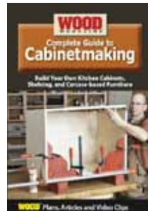
"Complete Guide" DVD-ROM's